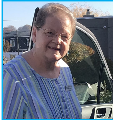
Dona , bilingual nurse, continues accompanying patients to medical appointments and prays for protection for herself and the medically high-risk patients in her car!